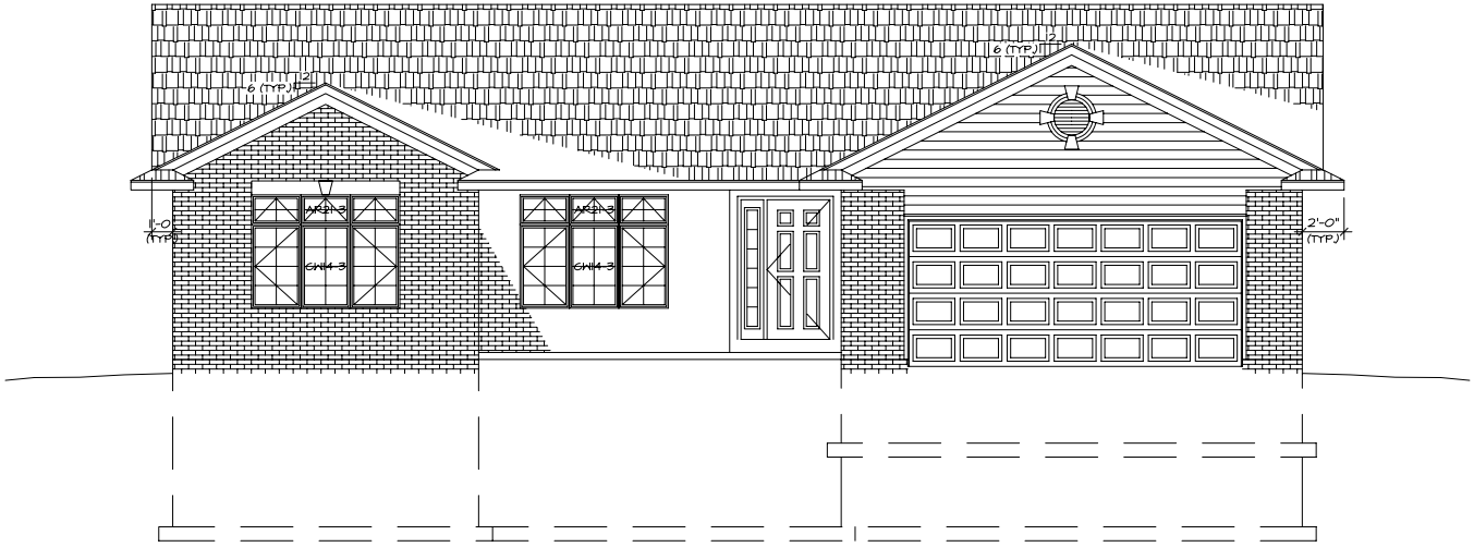
1 FRONT ELEVATION A-1 SCALE: 1/4"=1'-0"